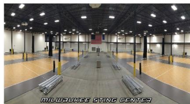
8 TaraFlex Volleyball Courts TaraFlex sport flooring offers the best in high performance, injury prevention and comfort.